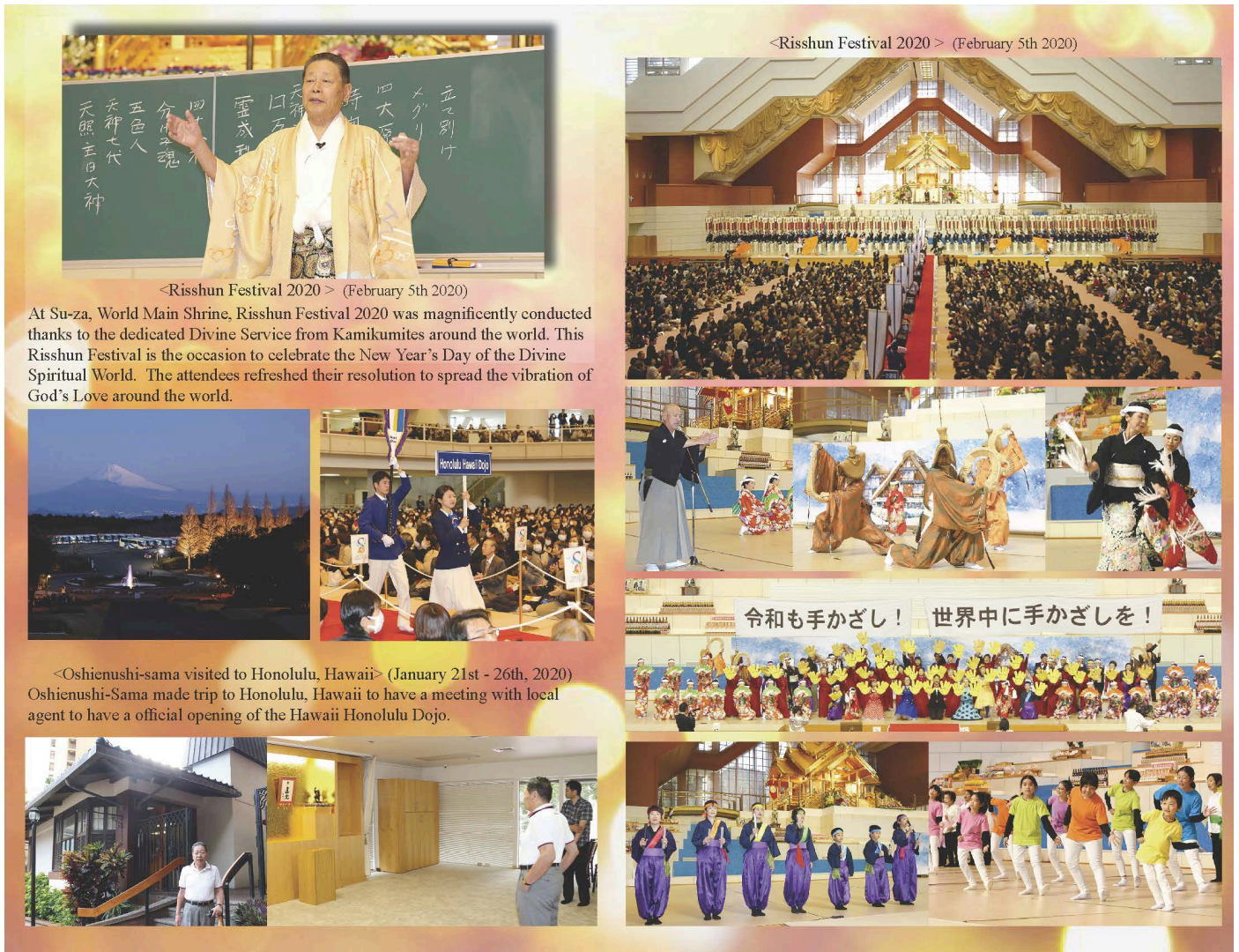
<Rishshun Festival 2020 > (February 5th 2020)